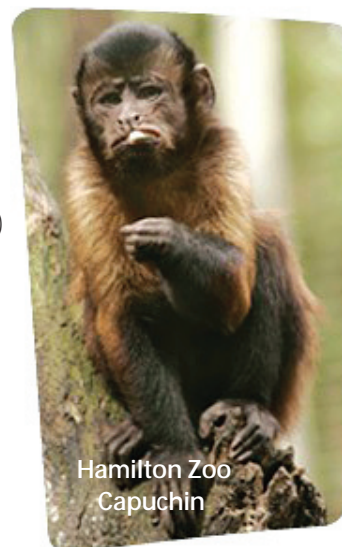
Hamilton Zoo Capuchin