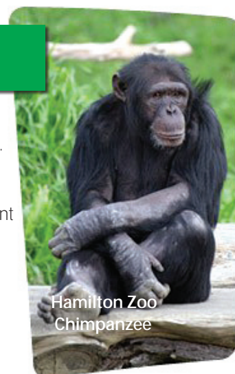
Hamilton Zoo Chimpanzee

July 3, 2009 will arrive sooner than you think so make a start during Term 4, 2008!